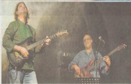
Music programme at Festember Cultural at National Institute of Technology (NITT) in Tiruchi on Thursday.

has the very first international performance of Festember this year. Featuring the Guns 'n' Roses cover