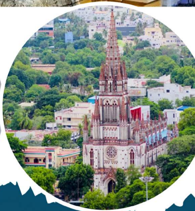
St. JOSEPH'S CHURCH