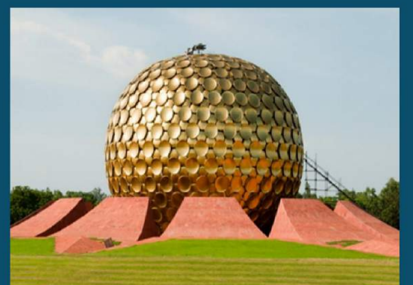
AUROVILLE, PUDUCHERRY (210 km)