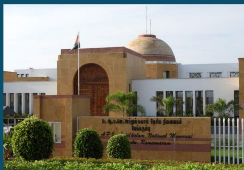
Dr. A.P.J. ABDUL KALAM MEMORIAL RAMESHWARM (225 km)