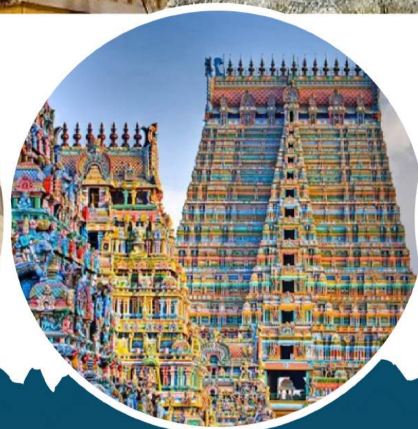
SRI RANGANATHASWAMY TEMPLE