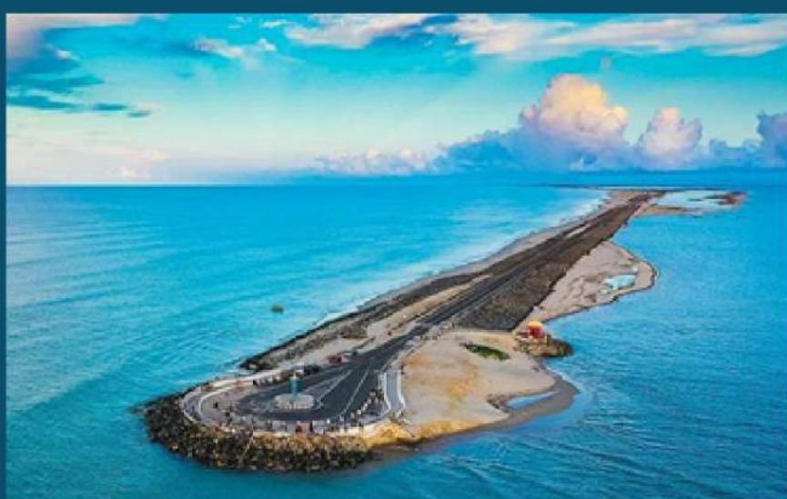
DHANUSHKODI, RAMESHWARM (250 km)