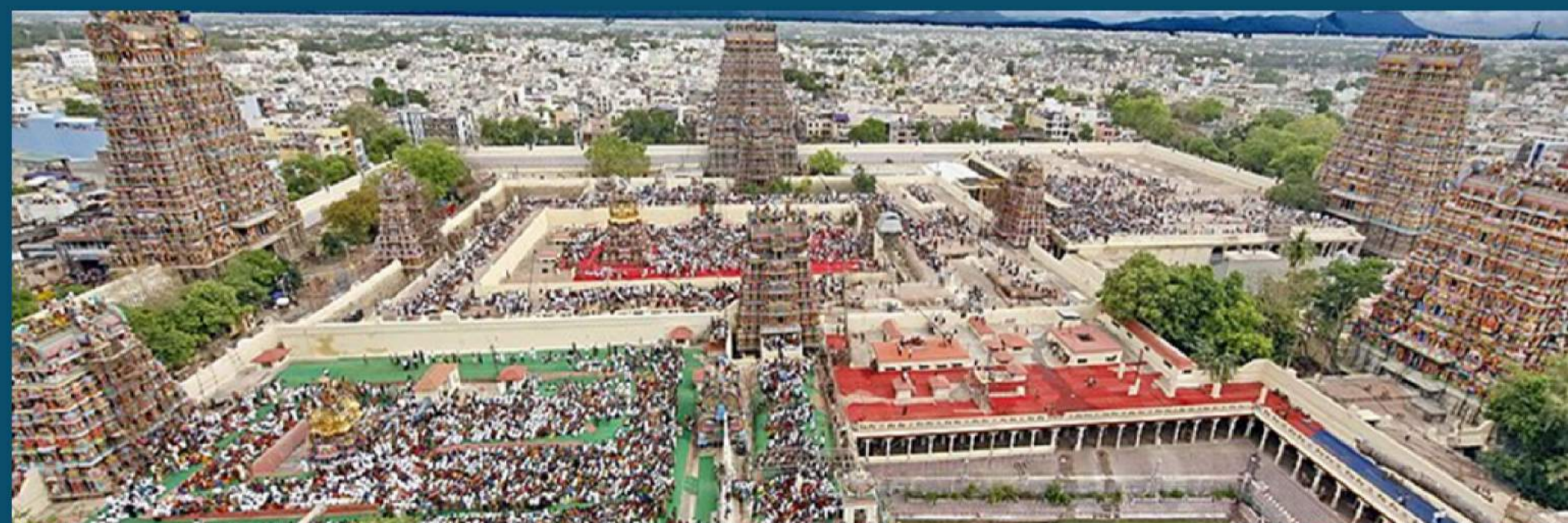
MEENAKSHI AMMAN TEMPLE, MADURAI (130 km)