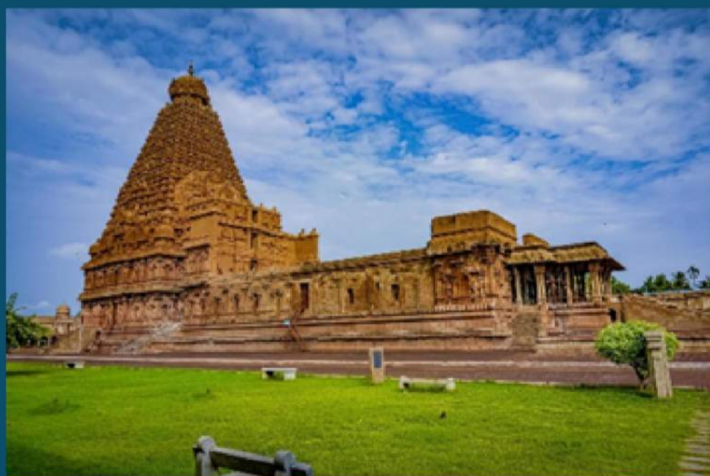
BRIHADEESWARA TEMPLE, TANJAVUR (60 km)