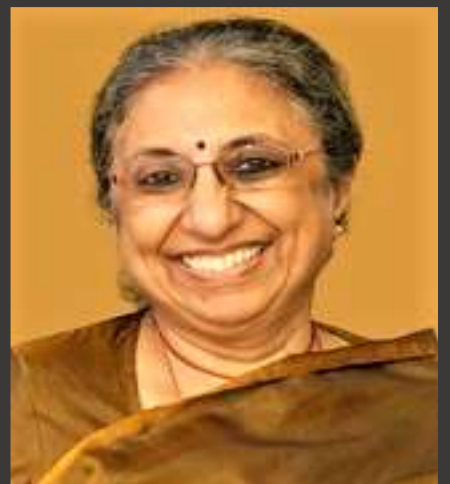
JUSTICE PRABHA SRIDEVAN Translator