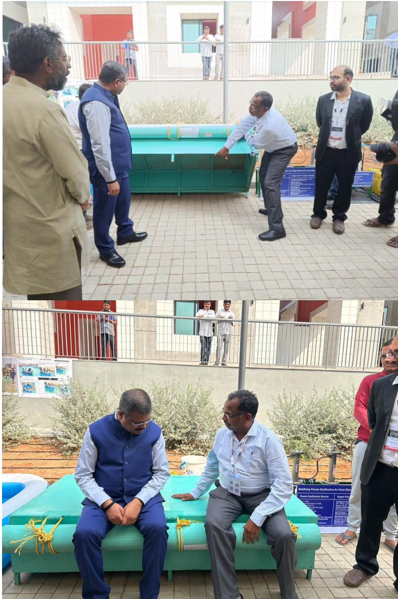
Figure - Honourable Minister of Education and Minister of Skill Development, Govt of India, Shri Dharmendra Pradhan, inspecting Fireboat during Inventure 2024 on 19th January 2024 at IIT Hyderabad