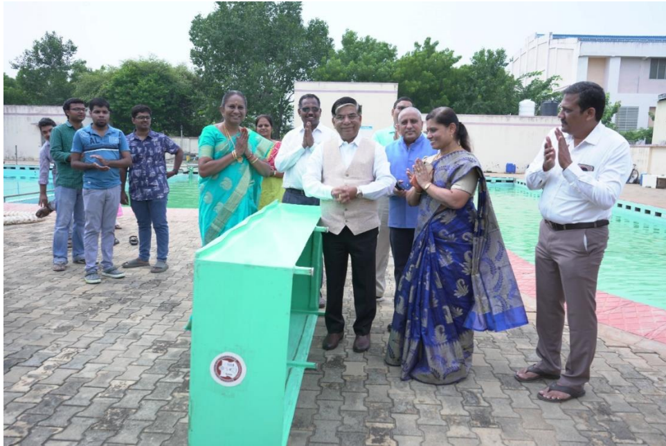
Figure - Honourable Union Minister of State for Education Dr. Subhas Sarkar inspecting Fureboat (Furniture cum boat) in furniture mode during his NIT Trichy visit on 31st October 2022